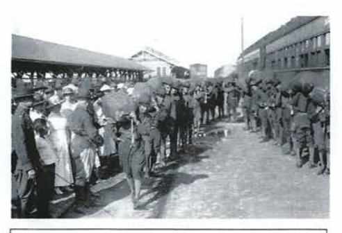
31st Brigade troop movement - Key West, Florida

Southern Baptist leaders charged all Baptist Camp Pastors to "give them the gospel." This was spelled out in a denominational challenge that stated "the Gospel of Christ that has been the comfort of the faithful, the solace of the bereaved, the highest joy of the living, and the only hope for the dying—this is what we are trying to give to our boys in the camps." ( FBW , 3/7/1918)