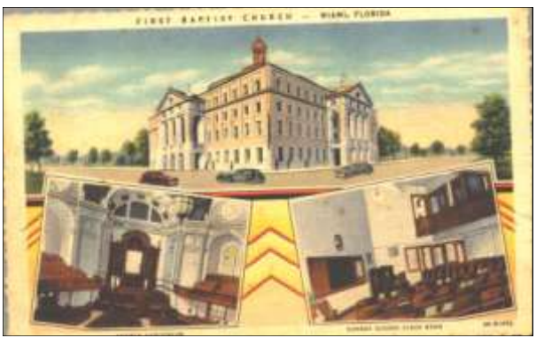
Central Baptist Church, Miami