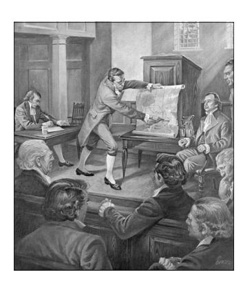
Luther Rice at Triennial Convention

Luther Rice (1783-1836) was the publisher of The Columbian Star which was the first weekly Baptist family newspaper in the United States. Rice began the journal in 1822 but the publication was closely tied to Columbian College, Washington D. C. and failed because of debt and lack of support. If this sounds like failure remember Luther Rice is known as the man who "changed the scattered Baptist churches into a Baptist denomination."